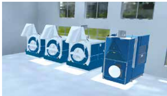
The worldwide first virtual laundry! Interested?